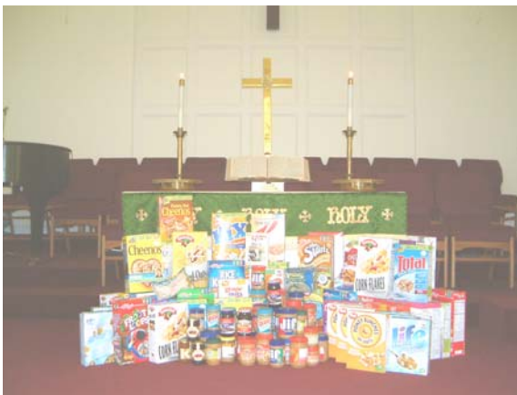
Pantry items donated in August.

people in this way. We are glad that a number of social service agencies refer people to us.